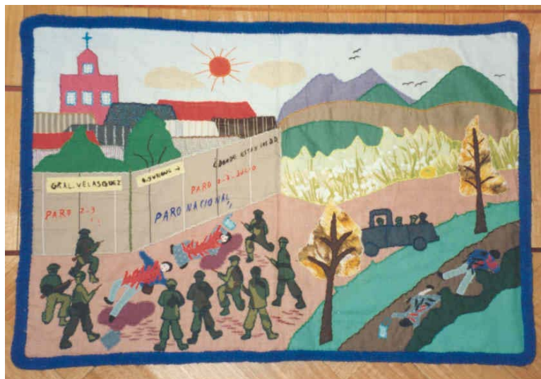
Figure 9 — Arpillera depicting two students being set alight