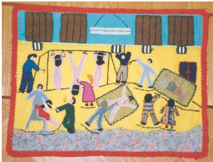
Figure 8 — Arpillera depicting torture

The arpilleras themselves also informed, since they showed aspects of the women's lives and repressive events occurring in Chile. They worked through figural depiction as well as symbolism. This one, for example, informs that torture is occurring: