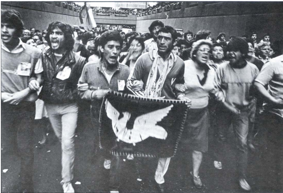
Figure 12 — Photograph of funeral march of André Jarlan

Furthermore, when it came to voting in the plebiscite of 1988, the arpillera groups were resources that the leaders of the “no campaign” could draw on. The political party members