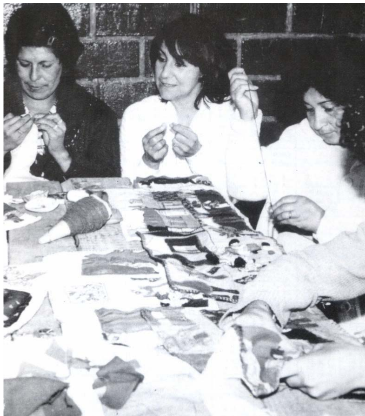
Figure 1 — Inside an arpillera workshop

Beginning just over a year after the 1973 coup d’état , women from Santiago’s shantytowns and relatives of the disappeared began making the art. For most, the motivation was to earn money with which to feed their families. For a minority (a group of relatives of the disappeared) the wish to engage in a therapeutic activity and to tell their story were salient motives. The women worked, typically, in chapels in shantytowns, as priests were willing to lend them a room.