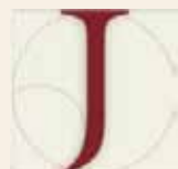
Observatório Permanente da Justiça Portuguesa