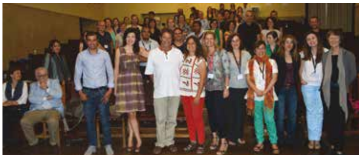
EDiSo, Sevilla, Mai 2014