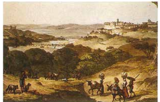
Urbe Conimbricensis, ao começar o século XIX vendo-se a ponte de pedra, no Mondego assoreado Thomas St. Clair e Charles Turner, Londres, 1815

Participants: Architecture students from secondary school, PhD students in the areas of Urban Cultures and Portuguese Influenced Patrimony, among others